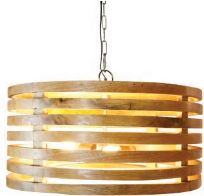
ALAN PENDANT WIDE #2317-L

This narrow wooden pendant has a slat design. Height: 28"