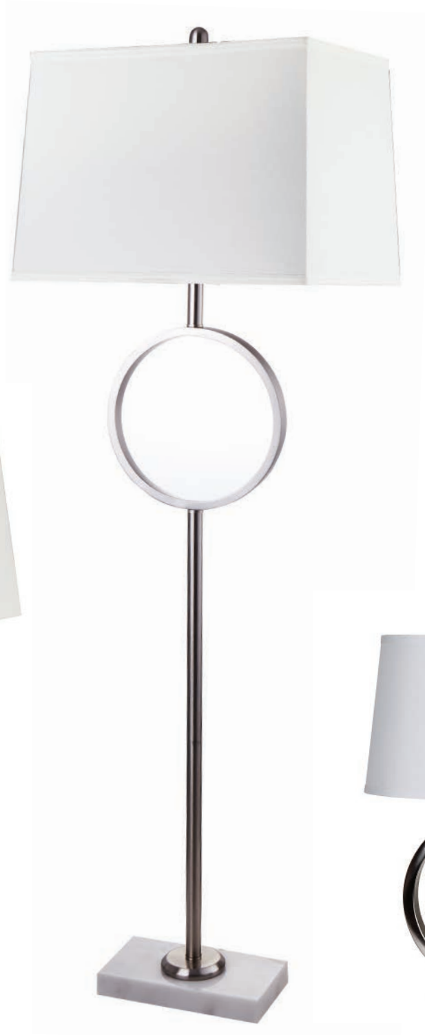
CHAPPAQUA FLOOR LAMP #FL6297

This simple metal ring buffet lamp is finished in brushed steel and sits atop a marble base. Height: 35"