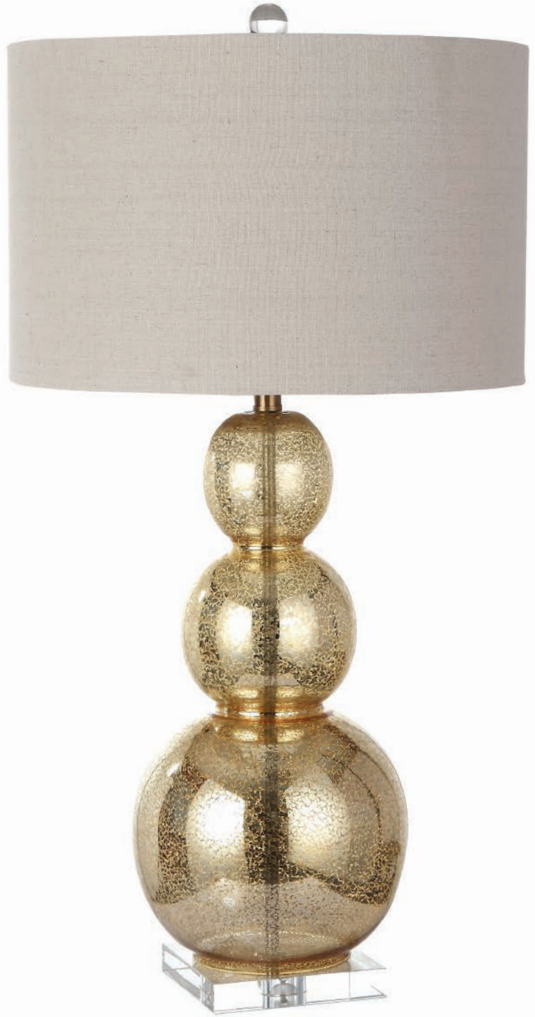
GRONK LAMP GOLD