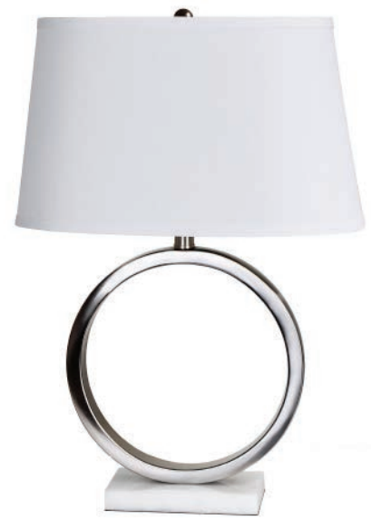
CHAPPAQUA TABLE LAMP #LS-160131

This simple metal ring floor lamp is finished in brushed steel and sits atop a marble base. Height: 62"