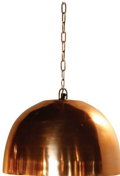
SLICK PENDANT #10665

This iron patchwork pendant is accented with a wooden cap. Height: 15.5"