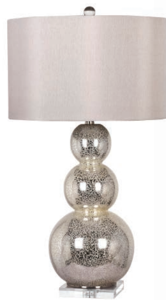
GRONK LAMP WHITE