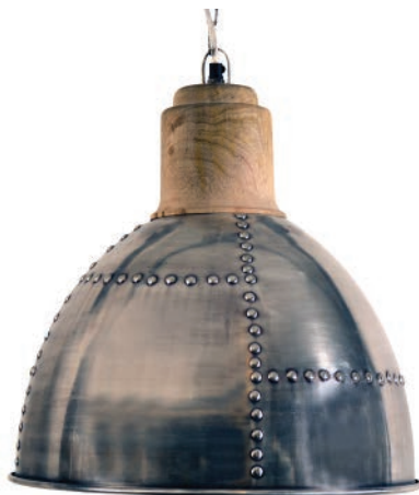
STITCH PENDANT #10436

This wide wooden pendant has a slat design. Height: 16"