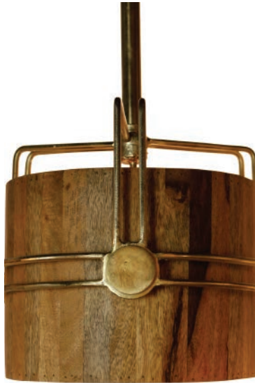
IRA PENDANT #2239-K

This large wooden pendant has brass accents. Height: 12"