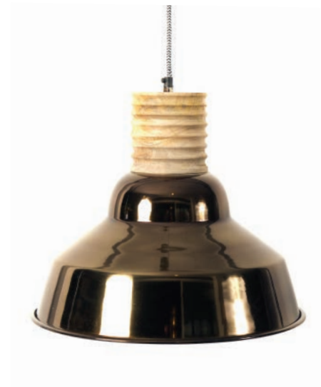
FIFI PENDANT #L-1303

This sleek copper-plated pendant has a dome shape. Height: 13"