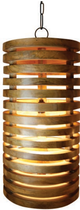
ALAN PENDANT TALL #2317-Q

This large wooden pendant has brass accents. Height: 12"