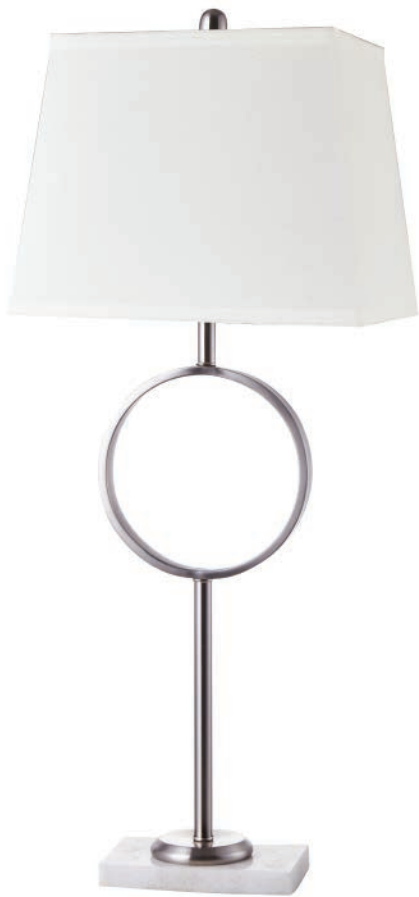
CHAPPAQUAU BUFFET LAMP #TL6296

This simple metal ring buffet lamp is finished in brushed steel and sits atop a marble base. Height: 35"