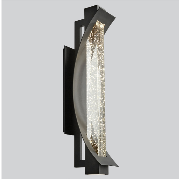
-15 Black (Lit)