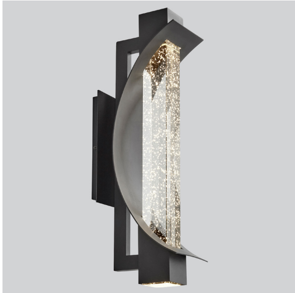
-15 Black (Lit)