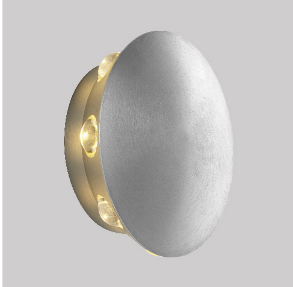
-16 Brushed Aluminum