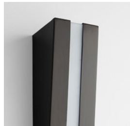
-22 Oiled Bronze