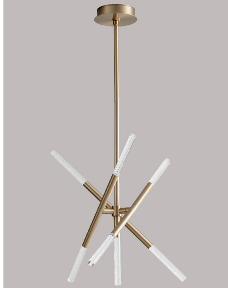
-40 Aged Brass