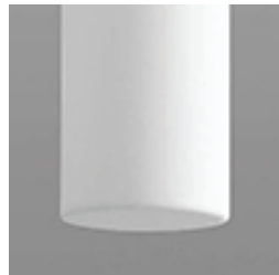
-1 White Opal Glass -2 Matte White Acrylic