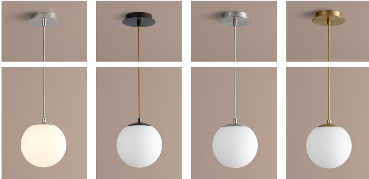
-20 Polished Nickel -22 Oiled Bronze -24 Satin Nickel -40 Aged Brass