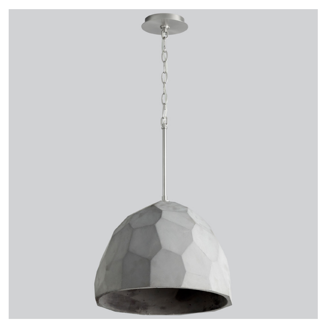
-1624 Gray/Satin Nickel