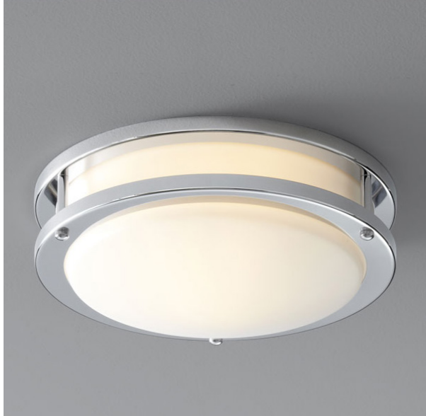
-14 Polished Chrome