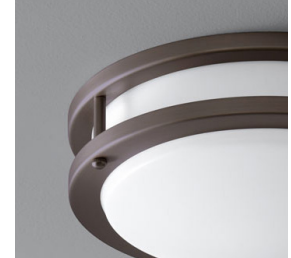
-22 Oiled Bronze