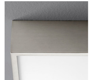
-24 Satin Nickel