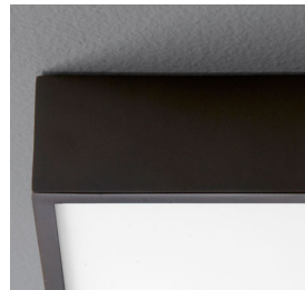
-22 Oiled Bronze