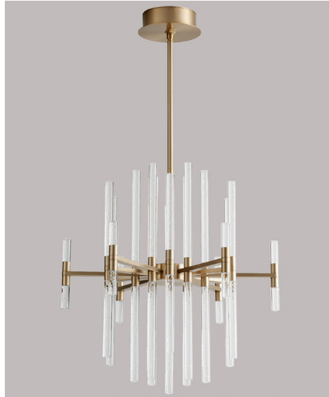
-40 Aged Brass