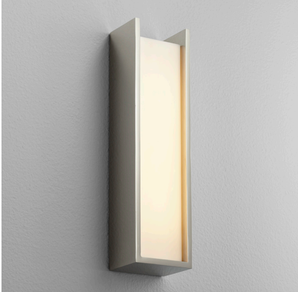
-20 Polished Nickel