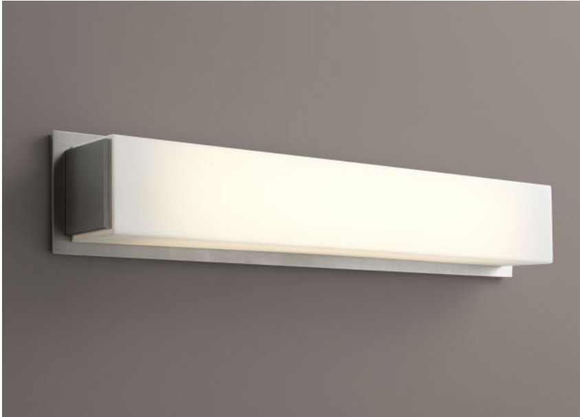
-24 Satin Nickel