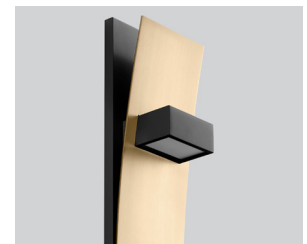
-1540 Black/Aged Brass