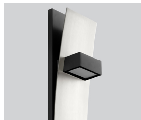
-1524 Black/Satin Nickel