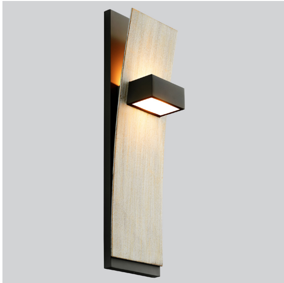
-1541 Black/Weathered Oak