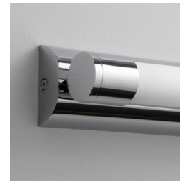
-14 Polished Chrome

LIGHT SOURCE 1 x 21W Florescent, T5 Linear fluorescent (mini bi-pin) (Lamp not included)